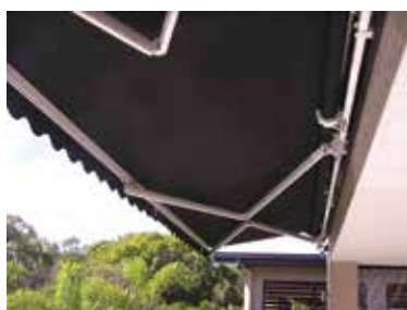
Amount of pitch available with the adjustable pitch control option

Available in a wide range of fabrics and colours, operation is simple, with options including manual crank or motorisation. Folding Arm Awnings can also be installed with an easy to use pitch control, giving you the adjustments needed to maintain optimum sun protection.