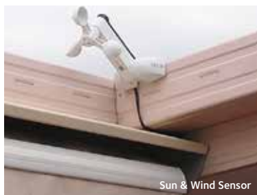
Sun & Wind Sensor